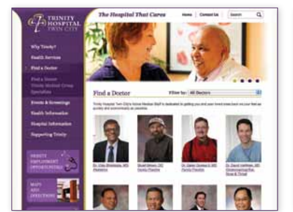
Find a Doctor

Also please be sure to download our free mobile app for your phone/mobile device using this QR code. The app makes finding your physician's phone number and address easy.