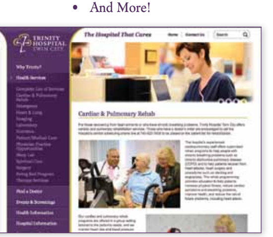
Find Information About Our Many Services