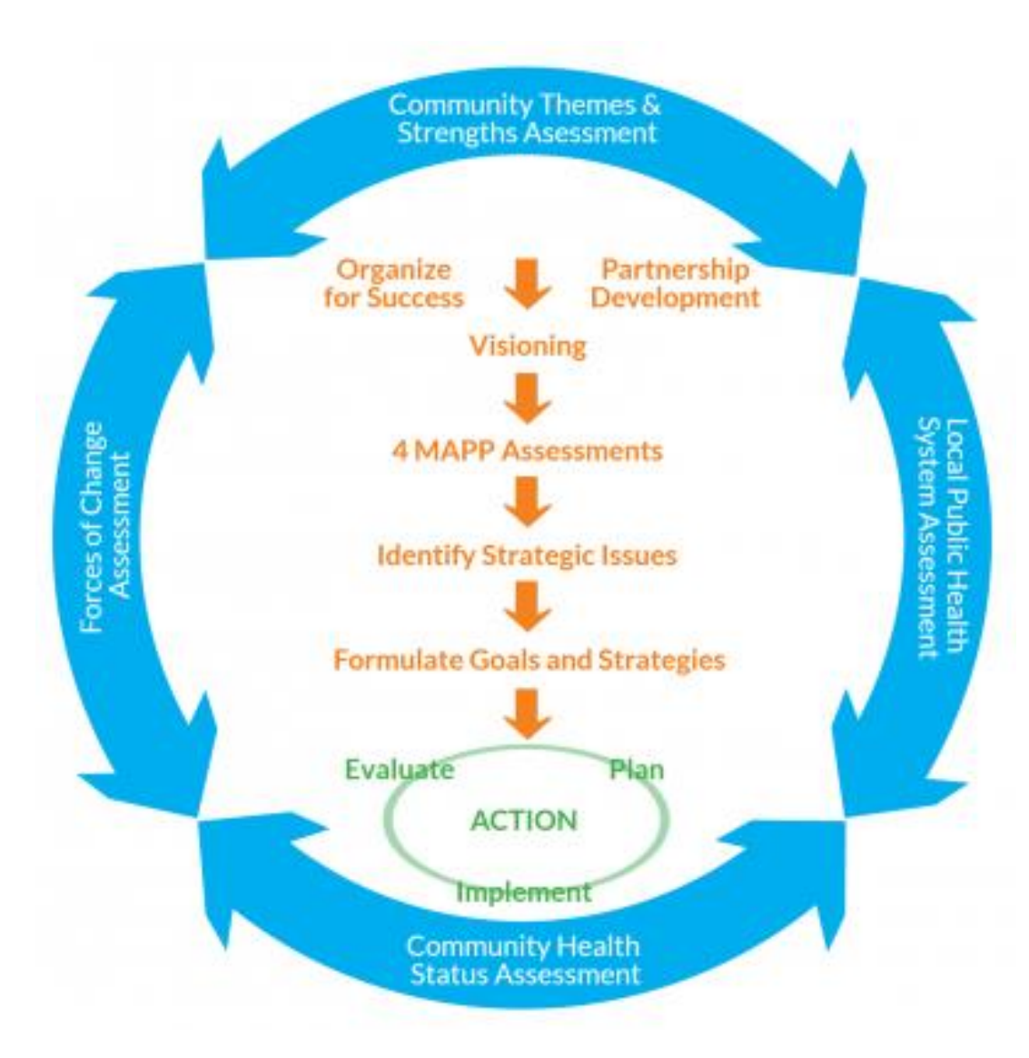
Figure 1.1 The MAPP model

The MAPP process includes four assessments: community themes and strengths, forces of change, local public health system assessment, and the community health status assessment. These four assessments were used by Healthy Tusc to prioritize specific health issues and population groups which are the foundation of this plan. Figure 1.1 illustrates how each of the four assessments contributes to the MAPP process.